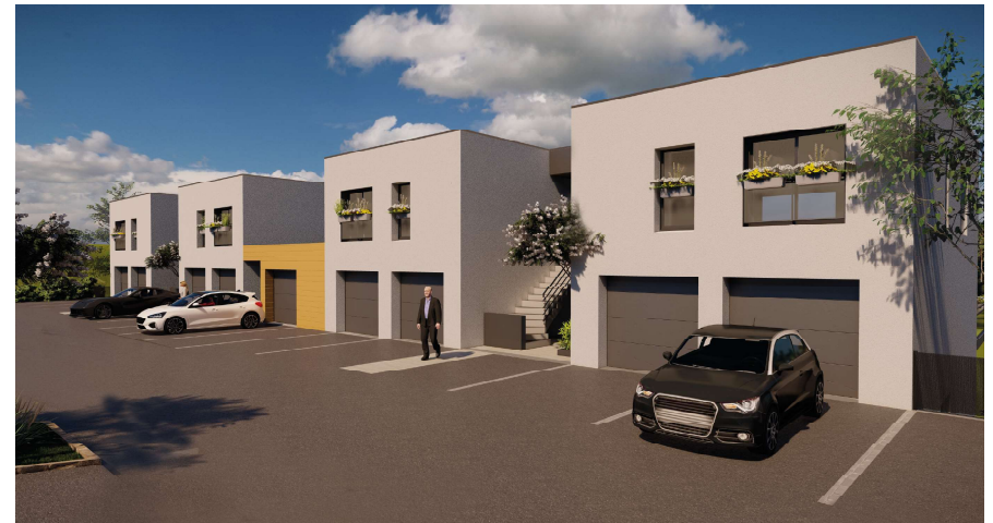
Log. 11- T3 Niveau R+1